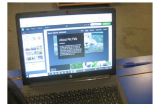
Website design in Year 6