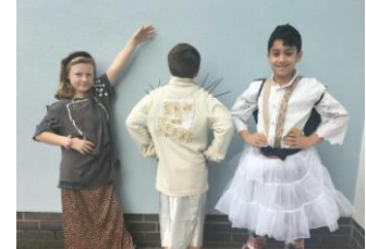
Clothing designs inspired by Vivienne Westwood

https://www.bewseylodge.co.uk/our_school/children_s_voice/friendship-awards/?cms=true