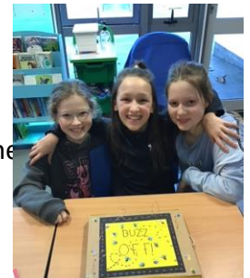
Battery powered games in y5/6.